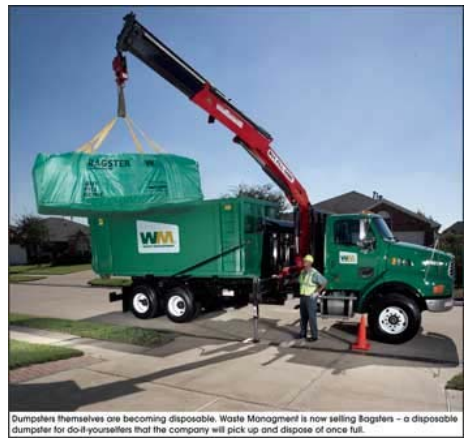
Dumpsters themselves are becoming disposable. Waste Management is now selling flaggers – a disposable dumpster for do-it-yourselfers that the company will pick up and dispose of once full.